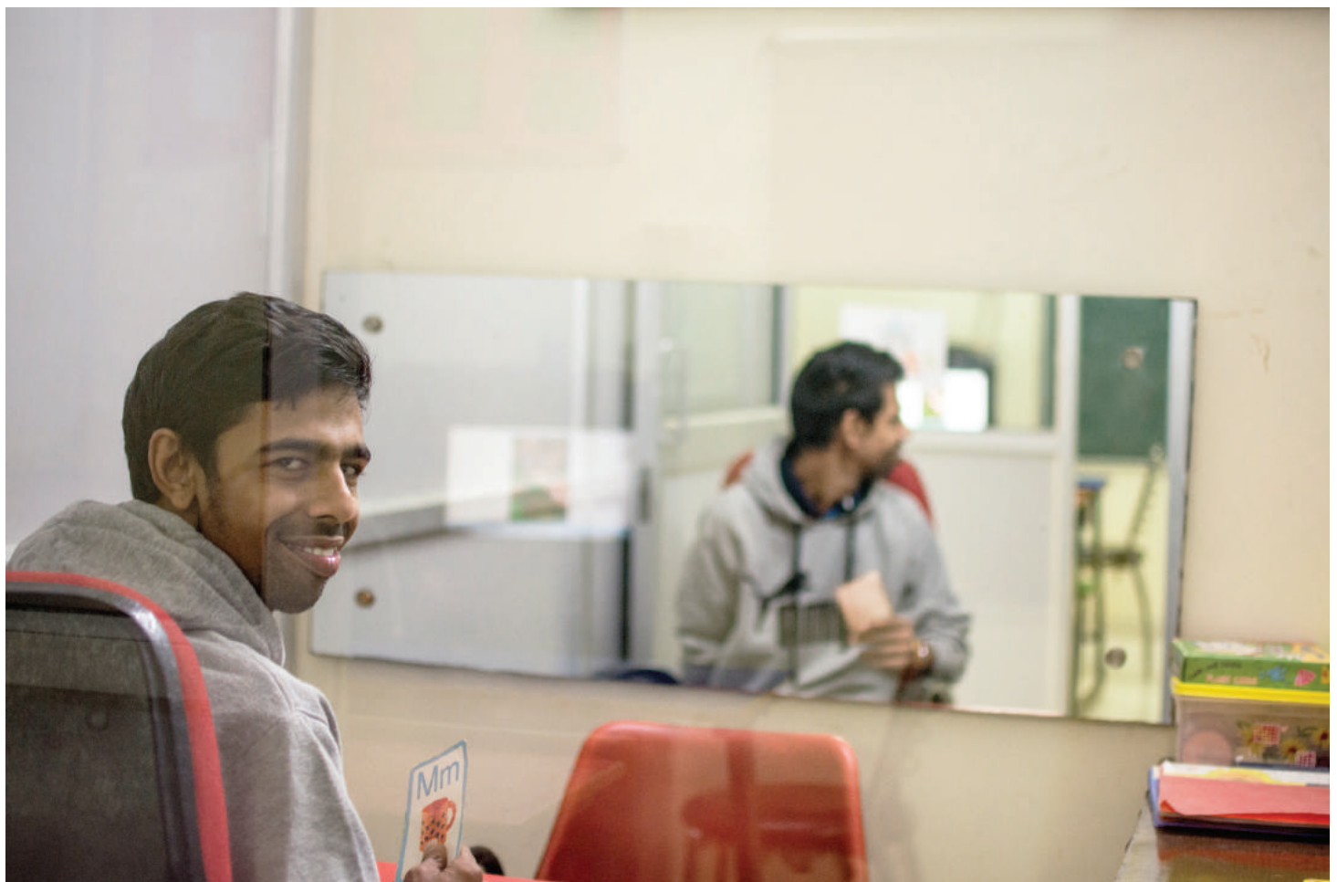
Student taking the speech therapy at BrahmaShakti Special School

Under the aegis of Ekta Shakti Foundation, BrahmaShakti Special School was established to provide education to the otherwise neglected children living in South-West District of Delhi. Since its inception, the school has grown from strength to strength as the number of students in BSSS School has increased eight –folds in the past ten years and soon becoming one of the most reputed special schools in this region.